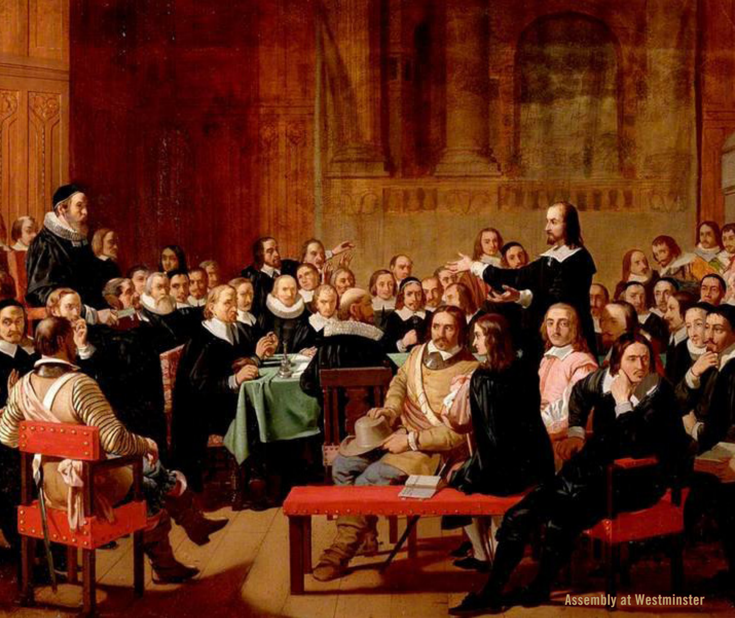
Assembly at Westminster