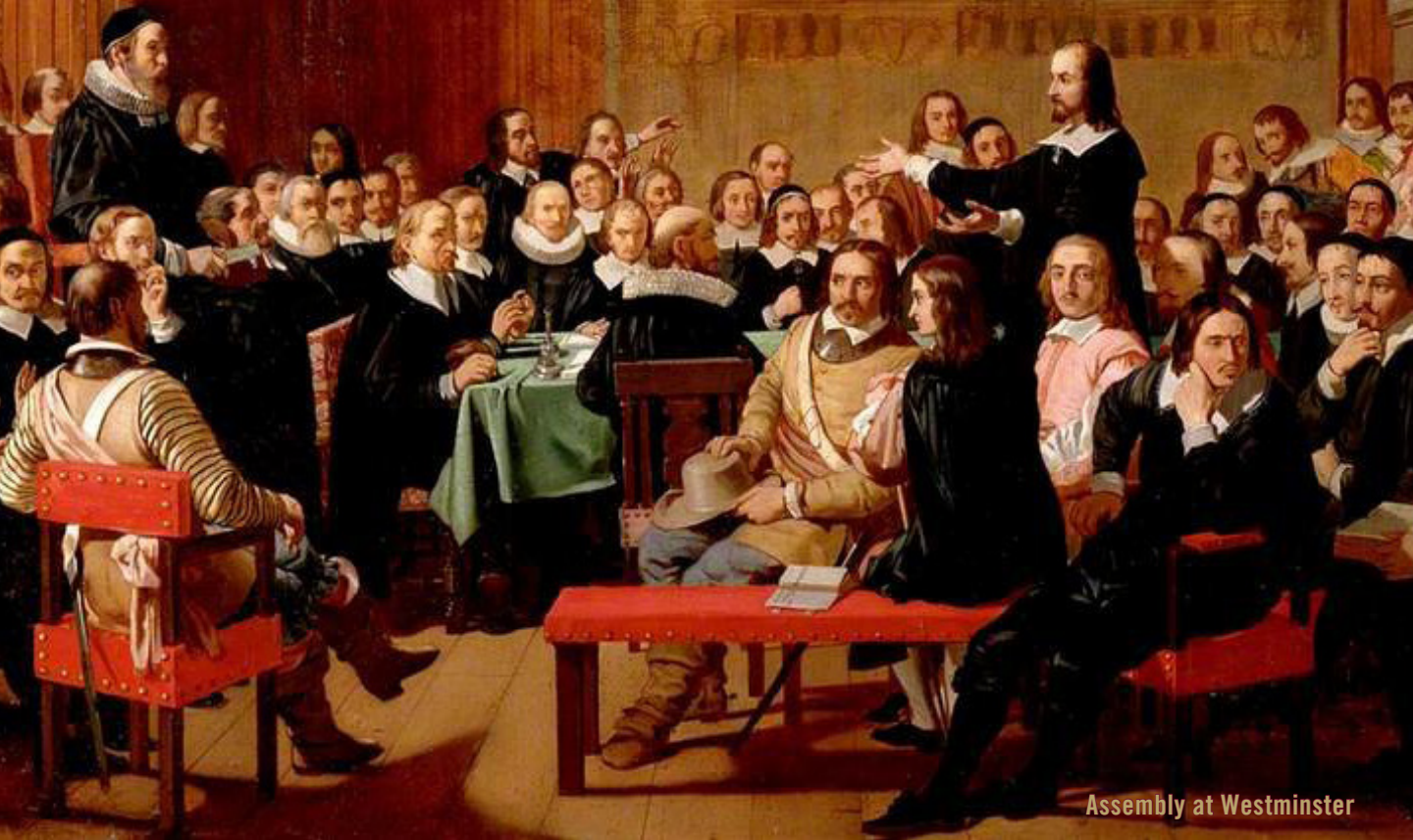
Assembly at Westminster