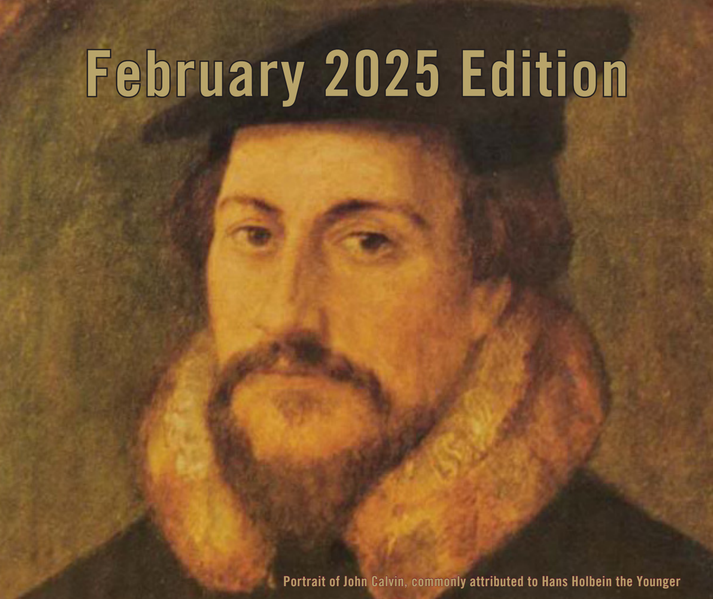
Portrait of John Calvin, commonly attributed to Hans Holbein the Younger